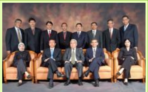
Board of Commissioners

actors. KPPU also seek for the same purpose, to prevent monopolistic practices and/or unfair business competition. KPPU's efforts to ensure that every persons doing business in Indonesia enjoy a healthy and equitable competitive situation are directed toward preventing the abuse of dominant position by certain business actor(s). Business opportunities resulting from the prevention of monopolistic practices will open wide consumers' opportunities to exercise their right to make appropriate choices. The resulting economic system is ensuring equilibrium between business actors' interests and the public interests which will increase public welfare ultimately.